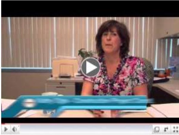
City of Henderson shares its performance contracting success stories.

Florida: Jacksonville Beach has issued an RFQ for Performance Contract for Guaranteed Energy, Water and Wastewater Cost Savings. Deadline is October 7, 2015. For more information contact the Jacksonville Beach Purchasing Division at 904.247.6229.